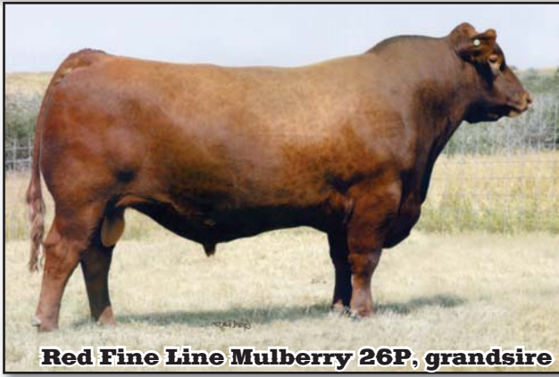
Red Fine Line Mulberry 26P, grandsire