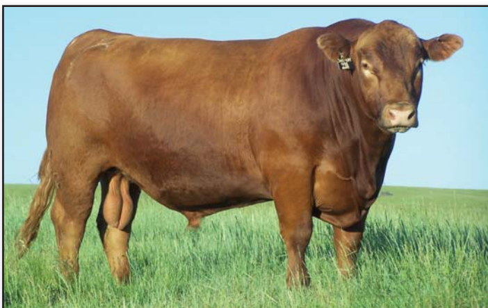
BMRA Mr Statement 998 Maternal grandsire to many bulls

Trojan was our pick and the high seller at the 2008 Heart River Ranch Sale. His sire is a Canadian-bred bull that is well known for his maternal traits and for having many sale toppers throughout Canada. His individual ultrasound ratios were 128%IMF and 107 for REA. In 2013 he sired the Grand Champion Market Steers at both the Williams County Fair and McKenzie County Fair. He ranks in the top 10% for MB.