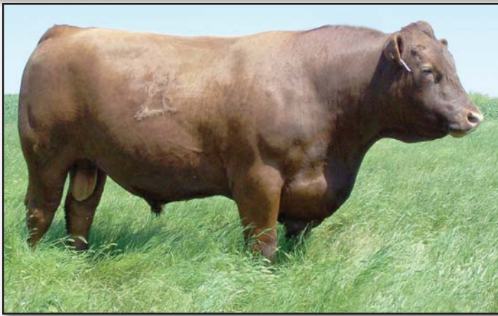
DK Trojan V4001