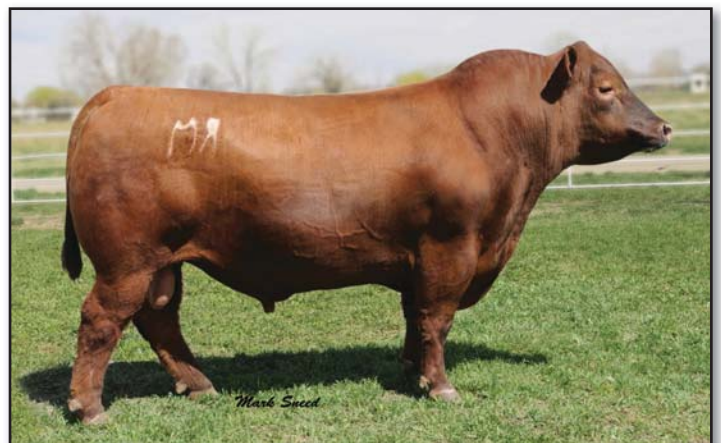
Messmer Packer S008 Paternal grandsire to the DK Packer sons

We raised this bull out of one of our best cow families. His dam is very moderate in size but will wean a calf with the best. We have not come across a Packer son that will give you this much performance. He is in the top 3% for WW and 2% for YW.