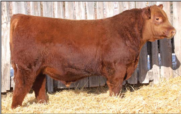
Red Lazy MC Lookout 39Z

NS Bronson was the $25,000 high selling Red Angus bull at the 2011 Midland Bull Test. In 2011, we traveled a lot of mile looking for a powerhouse bull that was equally impressive in maternal traits. Bronson was our #1 choice that year. His second set of daughters are calving now and we're 110% pleased. They are excellent mothers with a lot of milk. He ranks in the top 10% for HB.