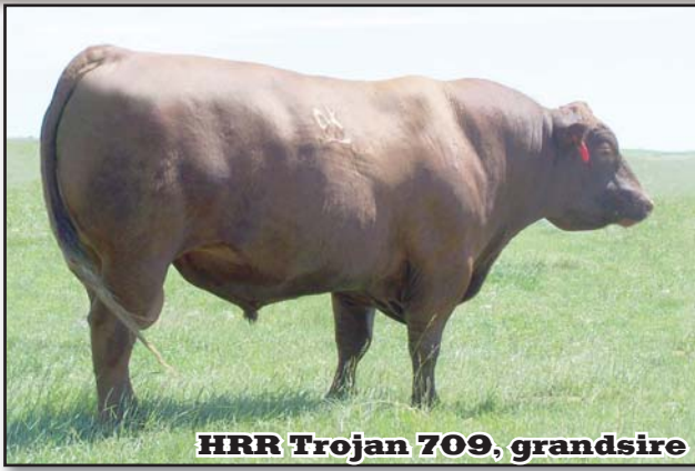
HRR Trojan 709, grandsire