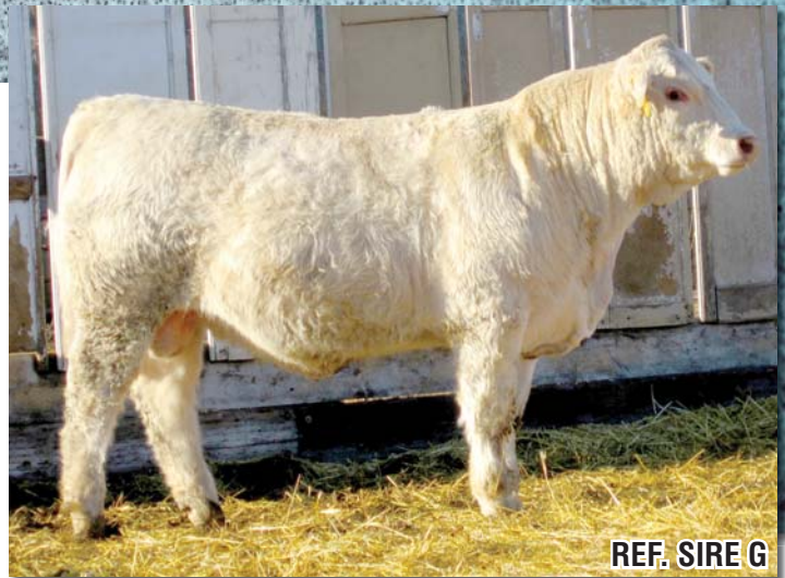
REF. SIRE G

This home-raised, homozygous polled bull is our heifer bull. He has worked well for two years on our first-calf heifers. He's a -0.2 for BW and a +10.2 for calving ease yet had a 1463 lb. yearling weight with a 110 index. He is a TT for Leptin. His first daughters do a great job of milking.