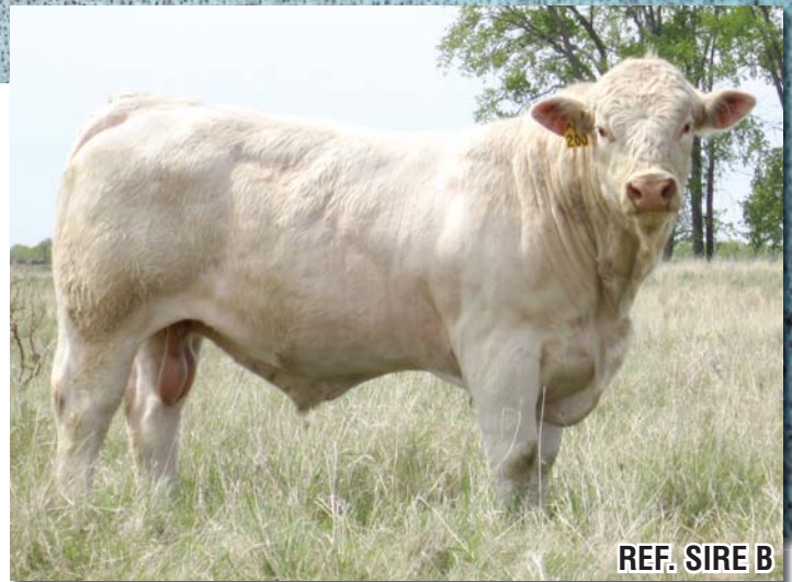
REF. SIRE B

Jaxson is a long-bodied performance sire that is very strong in the maternal traits. He sires that extra length that gives you the pounds without any problems. His females should be good milking, maternal females. Our top milking replacement heifers are sired by Jaxson.