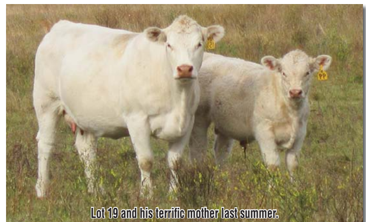
Lot 19 and his terrific mother last summer.

Our Jaxson herd sire is no longer with us due to a hip injury last year. After calving some of the first calf heifers sired by Jaxson, we decided we needed to keep this bloodline going. They have phenomenal udders, are very easy doing and always stay in good shape. This bull was contemplated as a replacement for Jaxson due to his easy temperament, structural soundness and muscle composition as well as being homozygous for Leptin and Tenderness.