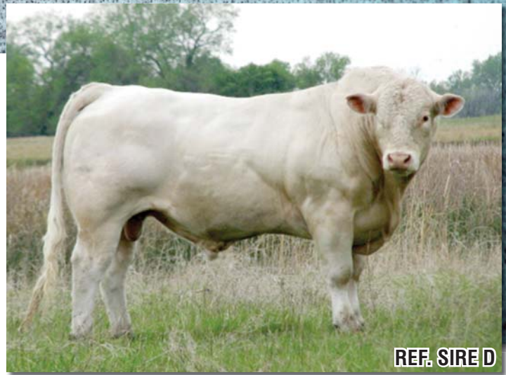
REF. SIRE D

Here's a bull built rock solid. Explosive muscle through his rear quarter, big topped and standing wide and square on all four corners. He's polled and has a 15.4 ribeye and is as sound and sure footed as they come.