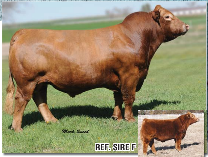
REF. SIRE F

A dark red bull sired by Fired Up. A very attractive bull that's square made, wide based, with a long level topline. The maternal side of his pedigree comes from the foundation of our red factor bloodline, Miss Key Cookie 242K. Retaining 1/4 interest.