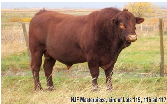
NJF Masterpiece, sire of Lots 115, 116 ad 117

He has all the DNA markers, big weaning and yearling numbers. His dam has an average weaning index of 103 on five calves.