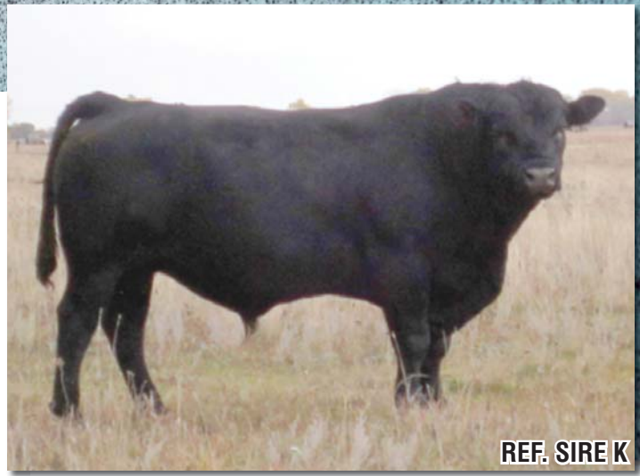
REF. SIRE K

2U is our slam-dunk heifer bull. His calves start small, gain well and have great carcass numbers. They have some of our top ribeye areas, all out of first-calf heifers. As a sire group, they are gaining over 4#/day. His calves are straight, strong topped and correct.