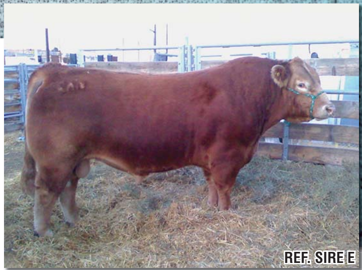
REF. SIRE E

This is the last calf out of the Chablis 166L cow as time caught up with her. She has had many bulls in our past sales and at least two were also sired by Clyde. They're quiet, sound made bulls that last.