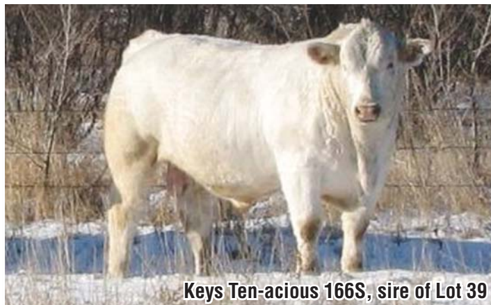
Keys Ten-acious 166S, sire of Lot 39

An ET calf out of Ten-acious and the mother of our Wishbone herdsire. There were only two bulls in this flush and we are retaining the other to carry on the Ten-acious bloodline as well as the Leptin and Tenderness DNA.