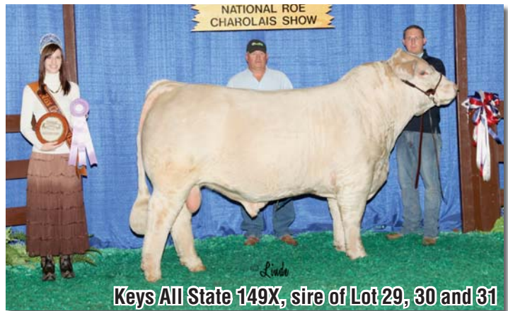
Keys All State 149X, sire of Lot 29, 30 and 31

Here's a good looking bull that definitely inherited his sire's attributes. Large ribeyes, well muscled hind quarters, small headed and structurally correct, all characteristic of the All State cattle.