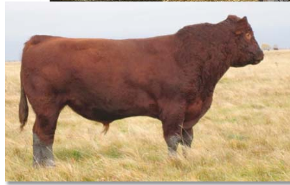
Key's Jenga, sire of lots 110 - 114