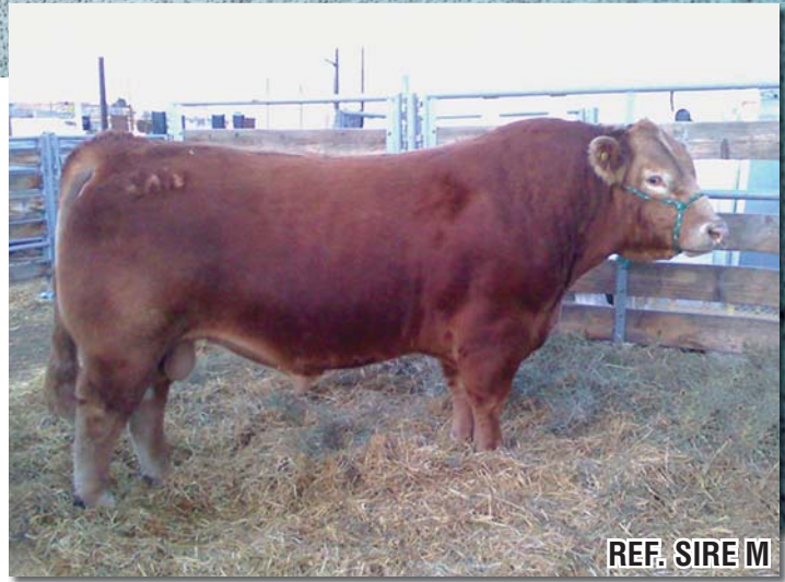
REF. SIRE M

One of our excellent 1/2 Char 1/4 Angus 1/4 Salers bulls. This is our third year of selling the black Clyde sons. What a great way to put the performance of Charolais in your herd while maintaining the black color and muscle. He's a TT and AA with a 117 IMF index.