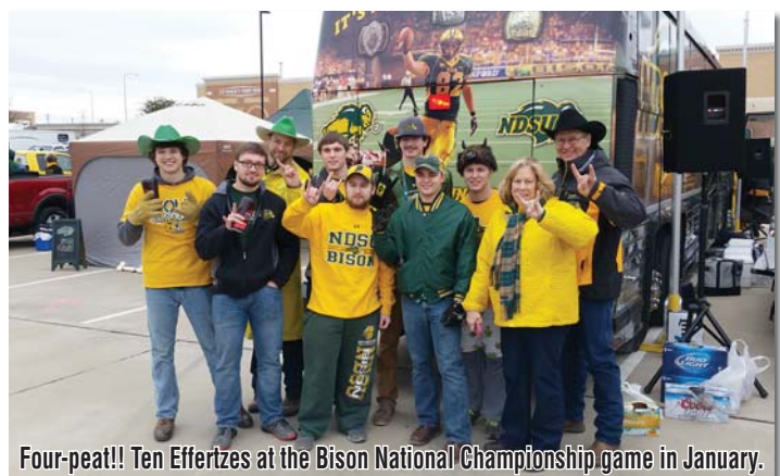
Four-peat!! Ten Efferizes at the Bison National Championship game in January.

I've noticed this bull all winter, he just seems to put on weight with ease. He is sired by Clyde so his great disposition is a given, he's soft made, deep sided, well muscled. He's gaining 3.8 with a 16.6 REA, all with an 84# BW.