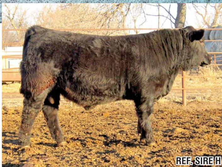
REF. SIRE H

This calf is a good example of our halfblood program. He's got our four DNA markers, an excellent look and great marbling numbers. He's one of the biggest, stoutest bulls.