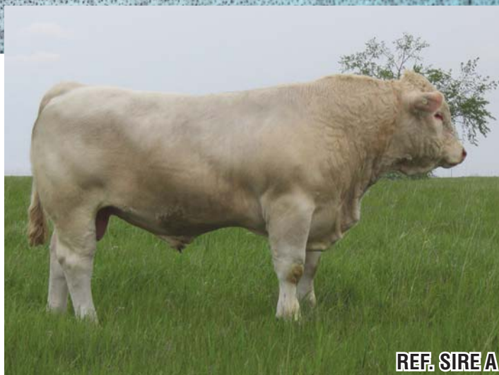
REF. SIRE A

A light birth weight bull with a low BW EPD. Long, clean made and as sound as they come, with a high marbling score of 4.31.