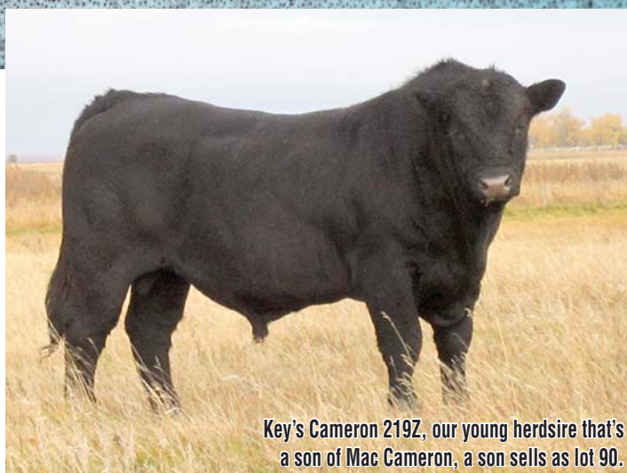
Key's Cameron 219Z, our young herdsire that's a son of Mac Cameron, a son sells as lot 90.

He's the top black purebred bull in sale, low birth, high performance, going from a 65# BW to a 120 profit index. His dam is a top 13 year old.