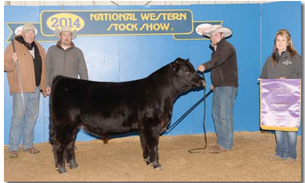
Lots 49, 50 and 51 are brothers to CRL Mr. Chain A4, 2015 National Champion Percentage Bull

Here's your chance to acquire an outstanding Lowline show steer out of a great Low Beau daughter and sired by the Nhance bull who is laced with that powerful Australian Ardrossan breeding. He's a March.