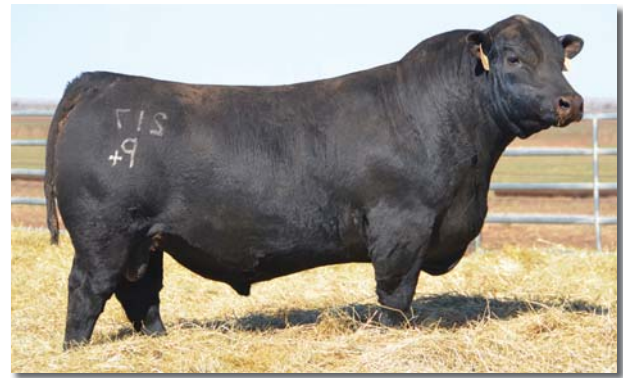
Duff's Pure Beef, sire of the embryos carried by Lots 36 and 37

Here's a halfblood Low Beau daughter who is carrying a halfblood embryo sired by the National Champion Percentage Bull EBC Ace and the Classy Beau 33X cow that was pick of the Tummons Cattle Co. herd, due March 4, 2016.