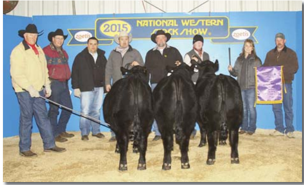
Lots 47,48 and 49 are brothers to the 2015 National Champion Pen of Bulls, sire by Little Joe

Here's a brother to the 2015 National Champion Percentage Bull. He's emen tested, trich tested and ready for heavy service. Ideal for first calf commercial heifers or as a herdsire for your Moderator breeding program.