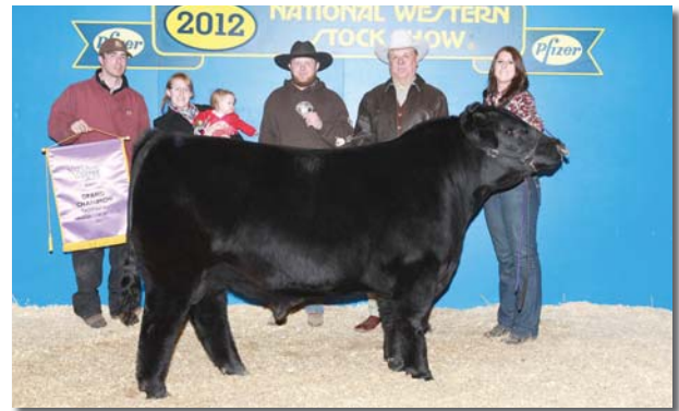
EBC Ace, 2012 National Champion and service sire to Lot 38 and 39

She is a quarterblood Lowline out of a Sim X Angus base bred to EBC Ace X74, the 2012 National Champion Percentage bull.