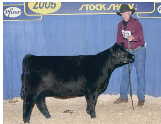
Bar J Nadine 9J32 3N57, 2005 National Champion, Lot 22

A National Champion bred to a National Champion! Nadine was the 2005 National Champion Female. She is extremely attractive, modest - sized, show - type female that complements an assortment of bulls. She is bred to Little Joe FM 3119 since May, 215.