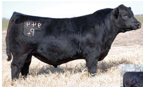
Duff Primo (left), Fairwyn's Contessa (inset)

Brambletye Transam BHR McKenzie Admiral J222 Brambletye Madame C208