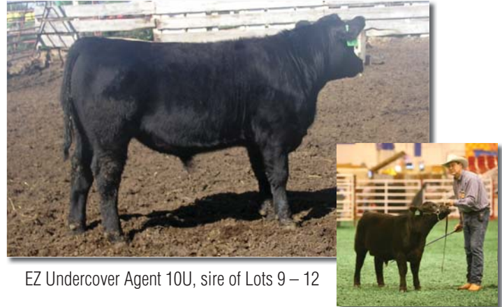
EZ Undercover Agent 10U, sire of Lots 9 – 12

This long fronted, long bodied female is another Undercover Agent daughter whose dam traces to the productive Bar J Tawney cow family. She is bred to Lazy G Rudys Red Comet FM 15253, a red fullblood bull, since 1/31/15.