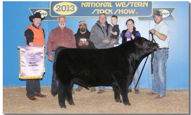
KBW Kessler, sire of Lot 52

An own son of the 2012 National Grand Champion Fullblood Bull KBW Kessler. These Kessler sons are a rare commodity. This is one of the few chances to win a great son of the National Champion. There are only 3 registered fullblood sons of Kessler in the ALR herdbook to date.