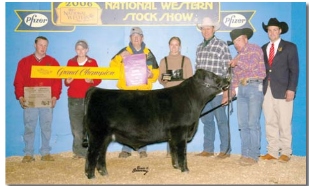
Little Joe, service sire to Lots 4 & 5 and all of the Hutch's Cattle consignments

Willow is an exciting Jamberoo daughter with a terrific outcross pedigree that traces to Zeus, Rouseabout and Kotinga Rocky. She is bred to Little Joe FM 3119, sire of the 2015 National Champion Pen of Bulls, since May, 2015.