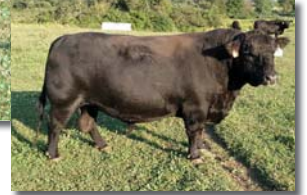
Jack Hck, Service Sire for Lots 19, 20 & 21