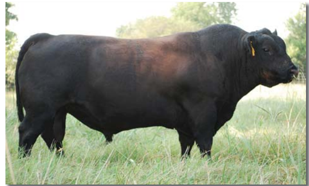
MCR Findon's Monarchy, sire of Lot 15

This senior heifer calf has a pedigree stacked with outstanding Lowline breeding and is a daughter of lot 14.