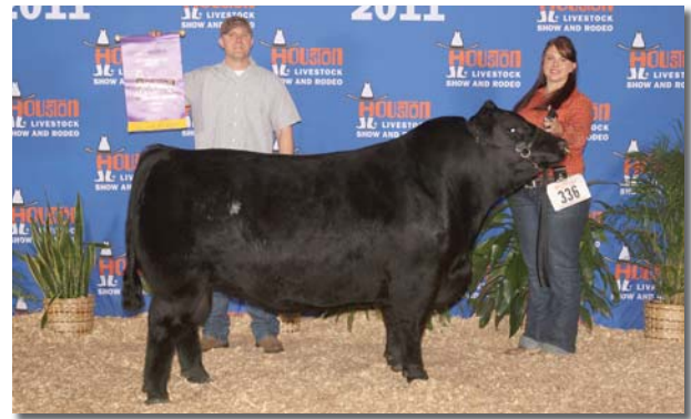
KBW Beau Vine, sire of Lot 14