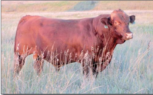
KKC Nobility 123Y