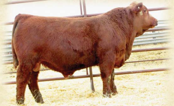
DDGR RICOCHET 9B