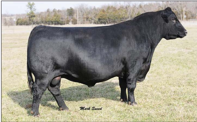
Ellingson Identity 9104

This sire packs his calves with meat, muscle and eye appeal in a moderate frame package. We will have more 4925 calves in our 2016 sale.