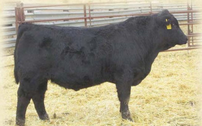
DDGR JACKPOT 64B