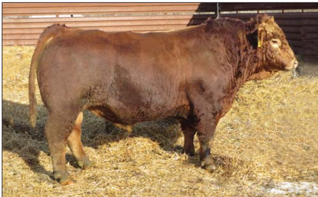
DVE Davidson Mr Dakota 151X

High seller at the 2011 Davidson sale in Canada. He has a super phenotype in a moderate-framed package. He stamps his calves with a wide top and thick quarter. His first daughters in production are deep bodied with excellent udders.