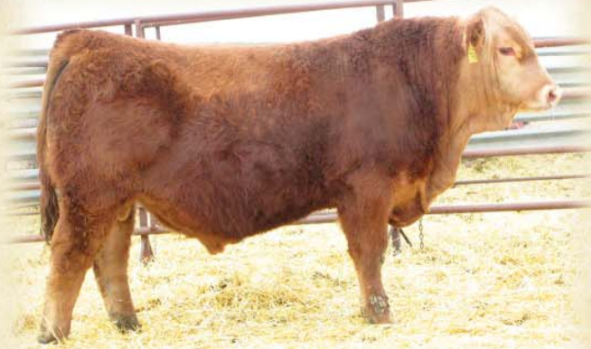
DDGR NOBLE MAN 79B