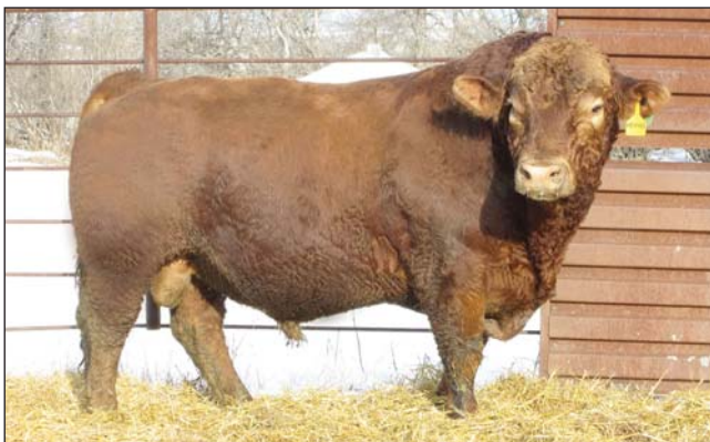
DDGR Home Run 35W

A Collateral son of the DDGR 62R cow we raised here. His calves are high-performance cattle with extra extension and larger frame.