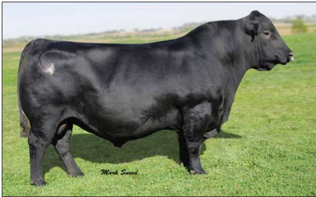
Connealy In Focus 4925

We purchased this bull from the Hojer Ranch in South Dakota for his balanced EPDs, length and muscle mass. His calves have the length and muscle of their sire.