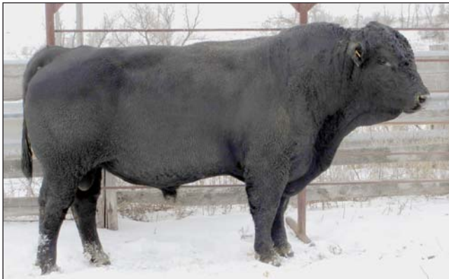
VRT Lazy TV Powerhouse X554

High seller at Kal-Kota's 2012 sale. This bull maintains or lowers birthweight while keeping performance strong and makes his calves dark red. He has excellent EPDs.