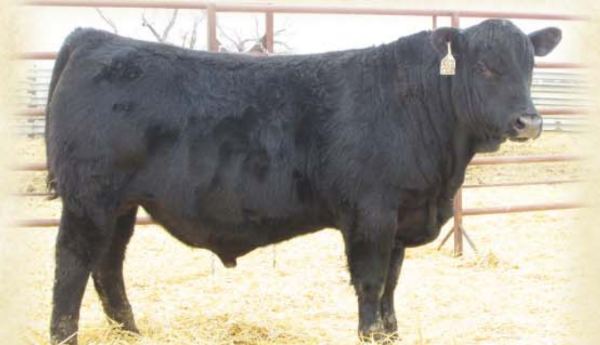
DDGR SMOOTH CRIMINAL 22B