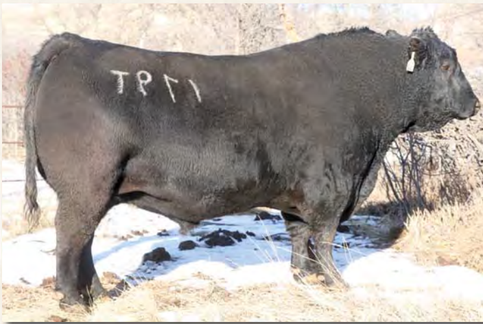
OPEN A 8180 179T ET, SIRE OF LOT 71