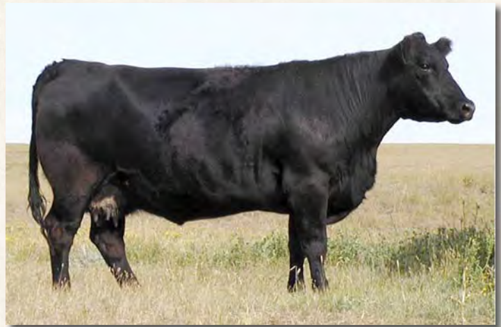
JANYBEE WILEEN 468F GREAT GRANDDAM OF LOT 18