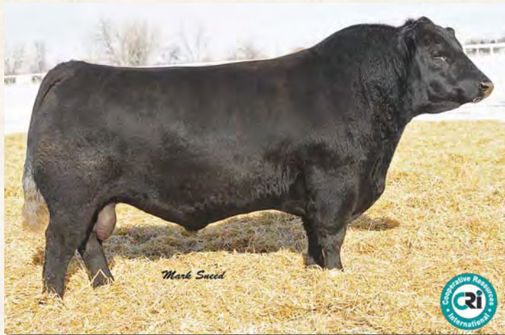
COLE CREEK CEDAR RIDGE 1V

Consistency is key in superior Angus genetics. Active Duty comes from a cow family that has consistently produced top herd bulls and test station winners. If you want power, stature, eye appeal and thickness in a moderate birth package it is hard to match Active Duty.