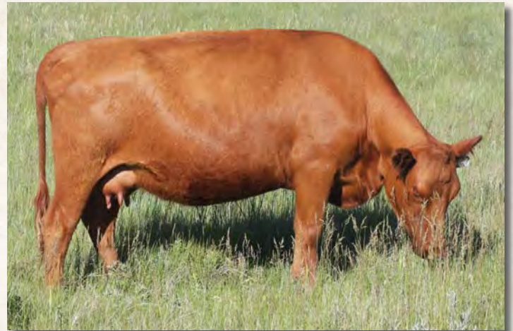
HRR MATTIE 627 DAM OF LOT 33