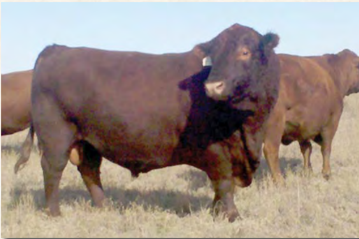
STEADFAST BOAZ T71