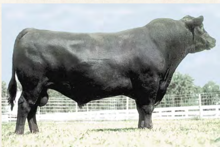
LEACHMAN RIGHT TIME

Cedar Ridge is a proven calving ease sire with an outcross pedigree making him an excellent option for In Focus, Traveler 004, Traveler 8180, Final Answer, Net Worth, Final Product and Image Maker daughters. Cedar Ridge and his progeny are sound and long-strided individuals with a good foot.