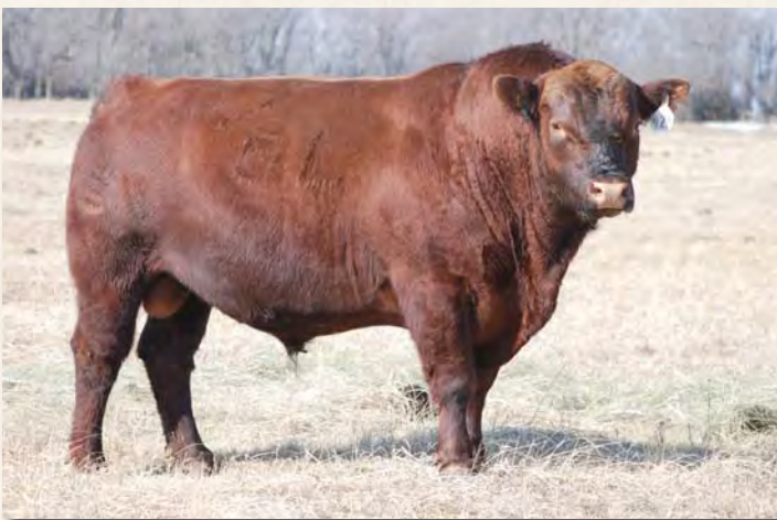
5L LEGEND 1553-425V

Feddes Montana is a very complete performance sire with a balanced EPD profile. Montana X44 sires thickness and is in the top 5% of the breed for REA. His first daughters