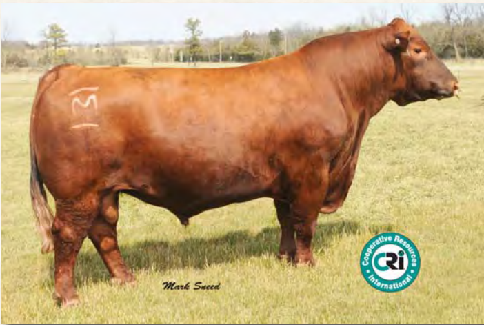
MUSHRUSH IMPRESSIVE CA U236