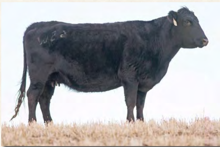
OPEN A 0415 HEROINE 165W, DAM OF LOT 40

Open A 165W Cedar Ridge B250 is starting the Open A Angus sale as part of a six pack of phenotypically attractive power bulls. This smooth made, wide bodied, Cedar Ridge 1V son has an even, consistent set of EPDs. His Zoetis genomic ally enhanced EPD's indicate that he is in the top 1% for milk and top 10% for $W. HERD BULL potential.