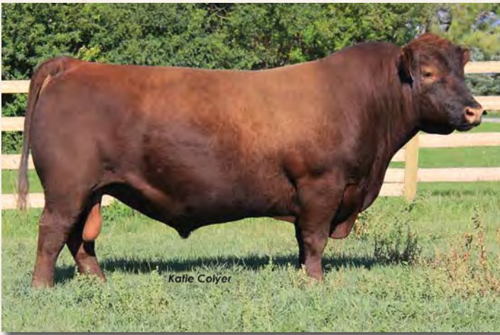
FEDDES MONTANA X44

Crowfoot Moonshine is a new bull in our sire lineup that we selected based on the high performance offspring he was producing in Canada. He subsequently sold to Genex and