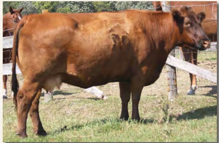
HRR COLLEEN 429 DAM OF LOT 14