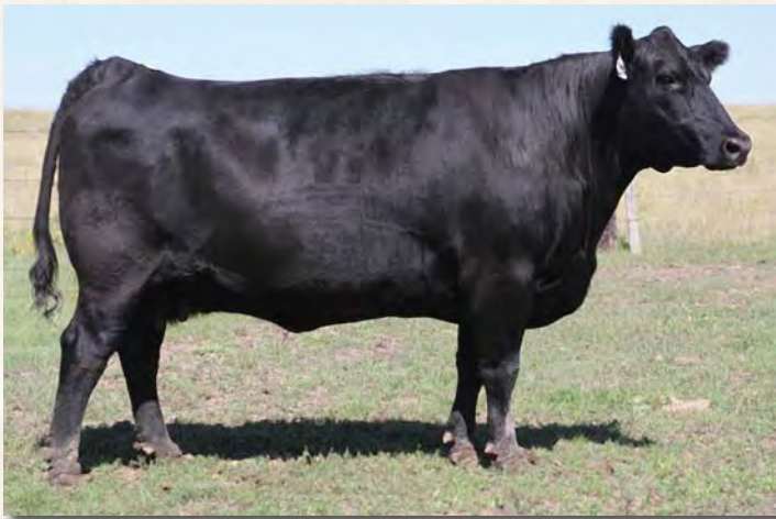
OPEN A 6595 240S DAM OF LOT 64