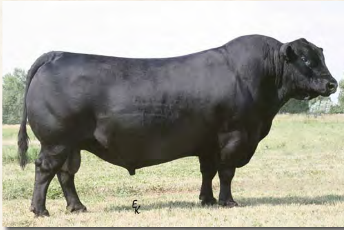
SAV FINAL ANSWER 0035

A well proven sire that is extremely popular all across the nation. Outcross to the New Design and most Precision off-spring. He is best known for his highly productive daughters.