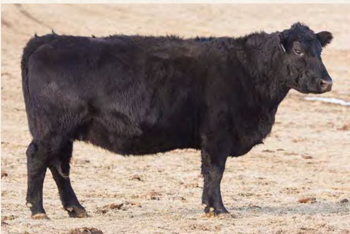
OPEN A 004 EILEEN 158W, DAM OF LOT 43

Open A 158W Tombstone B247 is a bull that you will like when you see him in the bull pen. He has an interesting pedigree with Sitz Upward 307R on the topside and a Sitz Traveler 8180 on the bottom. His dam, Open A 004 Eileen 158W goes back to the Jaynbee Eileen 468F cow, which was the first cow Open A flushed. The Eileen 158W cow is a really nice, moderate framed, big volume cow with a great disposition. Tombstone B247 is extremely well balanced with a nice birth to yearling EPD spread. He is in the top 10% for WW, YW and SC. Top 15% for $W and $F. Here is a HERD BULL that will add to your bottom line.