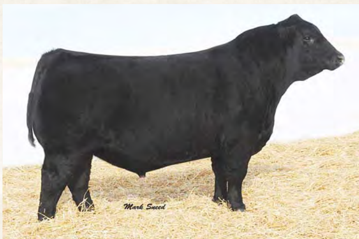
RB ACTIVE DUTY 010