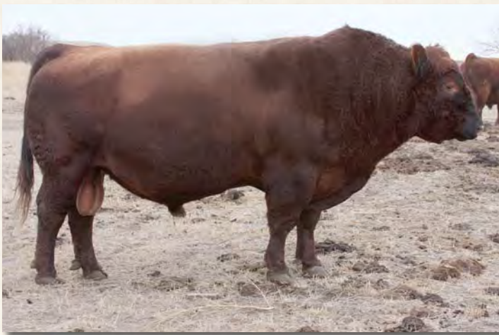
VGW LIBERTY 523, SIRE OF LOT 29

Here is a really nice profiling bull with a little different pedigree with performance from birth to yearling. His sire, VGW Liberty 523 has done a good job for us over the years and we have consistently retained his daughters. Dam BWR 97 WWR 102 YWR 102 MPPA 101.