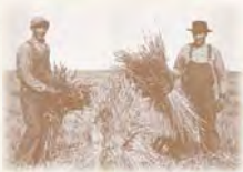
SIRE H RIDGE JULIAN S005-0099

We continue to use Boaz for his daughter's production capacity. Boaz is an udder improver with the ability of his daughter's to wean off a high percent of their body weight. In the top 9% of the breed for HB and a bull that provides value for convenience traits for the maternally focused operation.