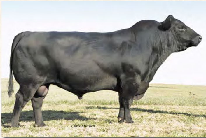
BCC BUSHWACKER 41-93