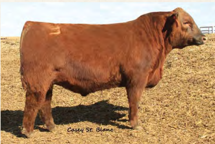
LOOSLI RIGHT KIND 205

5L Advocate is another change in our sire line up. We sampled Advocate because of his balance, moderate frame and exceptional ability to pass on marbling. He is in the top 1% of the breed in the GM index.