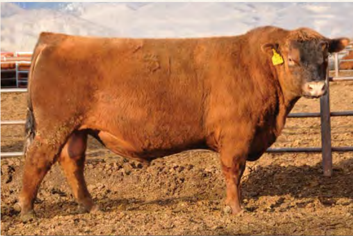
5L ADVOCATE 817-14W

Impressive is another balanced EPD bull with EPDS in the top 30% or better for HB, GM, BW, HPG, Stay, MARB, and REA. He traces back to a number of highly maternal cattle in the Red Angus breed. Progeny are dark red, moderate in frame and very functional.