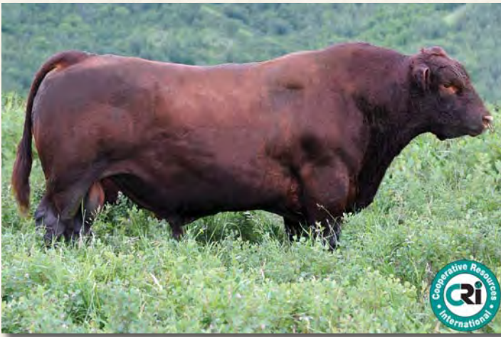
RED CROWFOOT MOONSHINE 8081U

then was lost with little semen available. We had a high percentage of daughters this year and they stood out at weaning and continue to look promising. We are told the daughters have correct feet and legs, great structure and make terrific brood cows. The sons put together performance, attractive phenotype and are very complete.