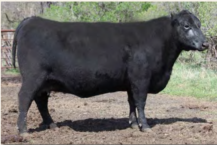
SSAF HC RACHEL 265, DAM OF LOT 65

Lots 63 and 64 or full flush brothers out of BCC Bushwacker 41-93 and their donor dam, Open A 6595 240S. You will want to keep daughters out of these two bulls, given the maternal genetics behind them.