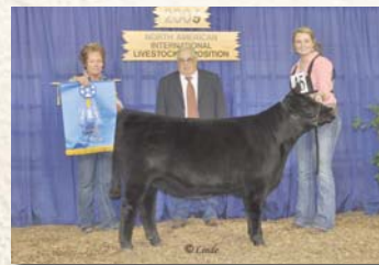
EZ Cinderella 61U, full sister to EZ Bedazzle 66U