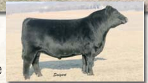
Longmire, service sire