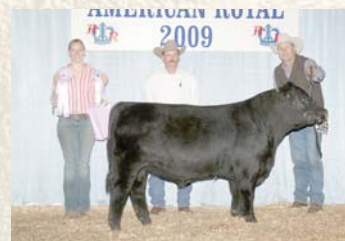
EZ Update 16U

Here is a very good assortment of superior EZ Ranch genetics. 2 embryos - Bonanza's Boxcar (2012 Reserve National Champion) X EZ Lady Luck 51N (Reserve National Champion), 1 embryo - EZ Update 16U X EZ Fantasia 20J, 2001 National Champion and dam of the high selling heifer calf at the 2014 Lowline Supreme at $7000, 1 embryo - EZ Lisbon 29L X EZ Tayla 38J, a pedigree loaded with longevity and carcass superiority.