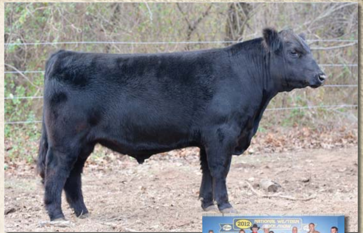
Lot 45 and his dam, "Roo"

MY MOMMA IS "ROO!" HOW DO YOU DO? His momma is Bar J Show Me The Way "Roo," the 2012 National Champion % Female and Supreme National Champion. His sire is EZ Captain Jack, the American Royal and Houston Grand Champion and 2X Denver Champion Fullblood bull, making him "TAYLOR MADE." THIS MAYBE THE BEST GENETIC OFFERING OF ITS KIND THIS YEAR! He is correct, muscular, masculine with extension and ready to go to work. Selling 3/4 interest and full possession.