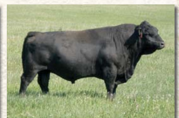
EZ Lisbon 29L