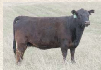
EZ Tayla 38J