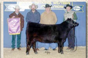
EZ Fantasia 20J