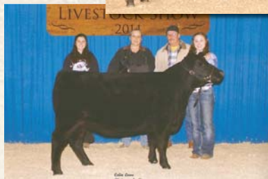
Alta Willow BIL 210Z