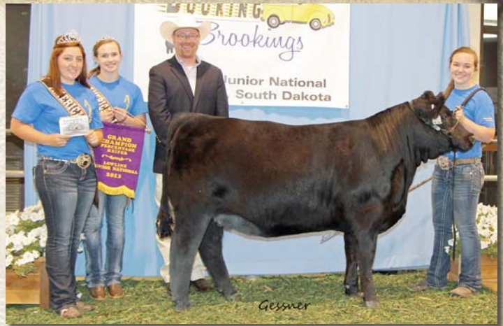
LR Lady 45, paternal sister to Lots 48 and 49

The Utah halfblood females have dominated the shows and sales in the percentage division for the last five years. Now we finally have a bull in the hunt! His dam's sire was the Reserve National Champion Chi Maine in Louisville and is sired by Kaboom. His dam's dam is sired by the cow maker (Who Made Who) of the club calf world.