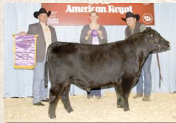
Bonanza's Prince 2Y