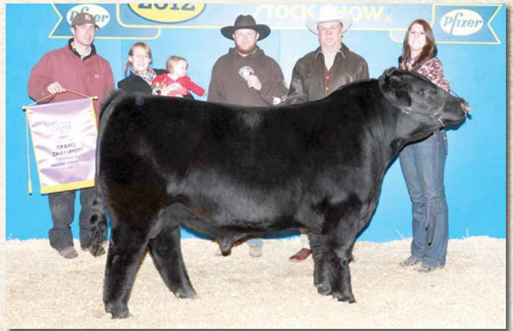
EBC Ace X74, sire of lot 32

Here is a real exciting red polled double halfblood daughter of the 2012 National Champion Percentage Bull EBC Ace X74 out of a paternal sister to the $85,000 Duff's Trust Me bull. This exquisitely bred red heifer calf has it all! Don't miss her.