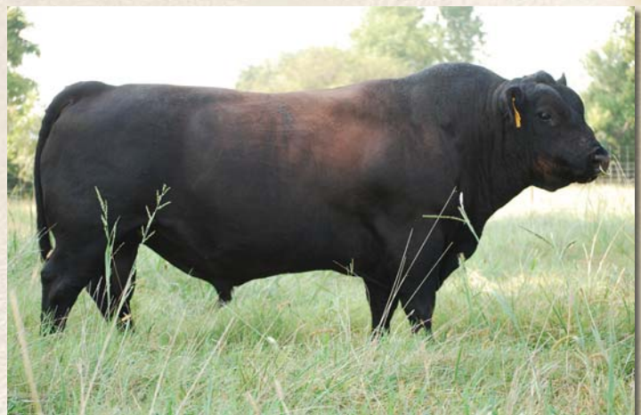
Findon's Monarchy, sire of Lot 44

Check out this clean made Monarchy son of the 2004 National Champion Female, Bar J Nadine 9J32-3N57. This November born senior calf will compete and leave some awesome females in your herd!