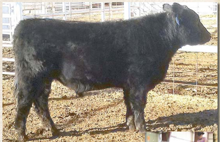
Lot 50 (above) and Little Joe getting ready for the champion drive (inset)

Look at the added length and dimension in this clean fronted, stout made, super attractive show steer prospect. With a good feed bucket, he'll be hard to beat at Junior Nationals this year in Manhattan, Kansas.