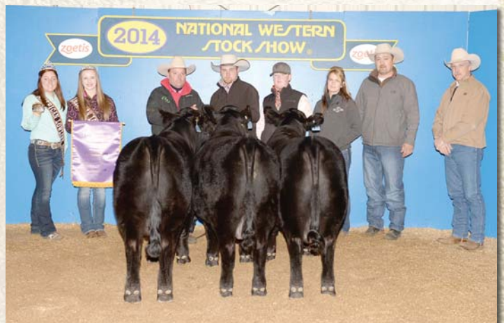
2014 National Champion Pen of Bulls, sired by Little Joe