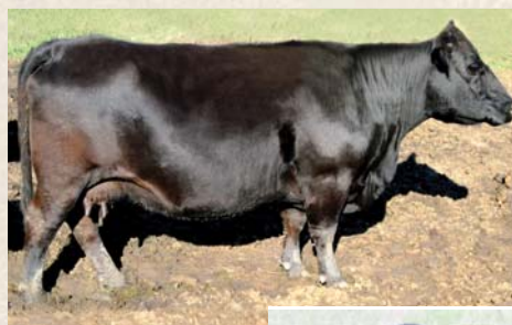
Wilde's Moray 41