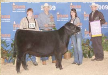
EZ Lacey 55