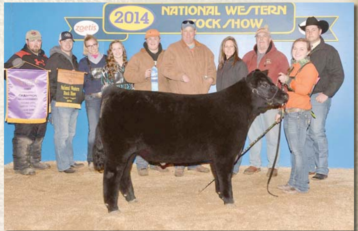
WDL That Just Happened 10A, paternal brother to Lots 48 and 49

Here's another excellent Utah son out of a Kaboy daughter...that makes him a 50% Lowline, 29% Angus, 11% Maine and 10% Chi. He's stout and has "the look."