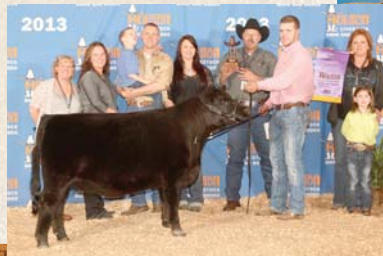
MCR Standing Ovation

Choose 6 embryos sired by the National Champion Little Joe FM3119 and out of these cows: MCR Standing Ovation FF17364, 2013 Houston Champion; K2K Sassafras 706Y FF14598; Alta Willow BIL 210Z FF19198; Miss Jets Brick 41Z FF18401; KBW Zola FF21812; 7C Miracle W3 FF8643. Little Joe was the sire of the 2014 National Champion Pen of Bulls as well as the Champion National Western Pen of Commercial Heifers.