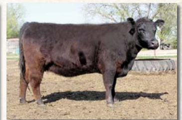
EZ Lady Luck 51N