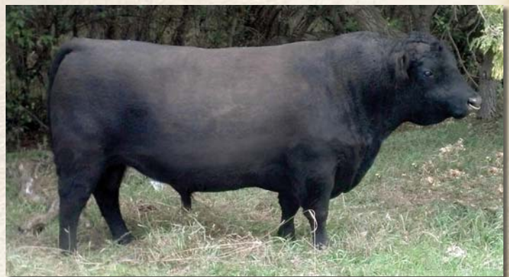
Johnnie Walker, sire of Lots 34, 35, 36 and 37

Becca is a moderate framed yet long bodied daughter of Johnnie Walker.