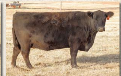
7C Miracle W3