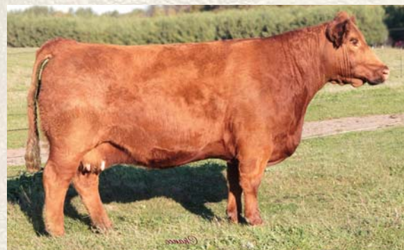
Reed Miss Demeanor

[ G & L AVALANCHE DRAKE SCREAM NICHOLS BLK DESTINY D12 WBF COW F674