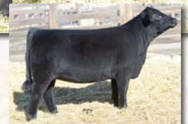
DCS Dazzle, maternal sister to Lot 46