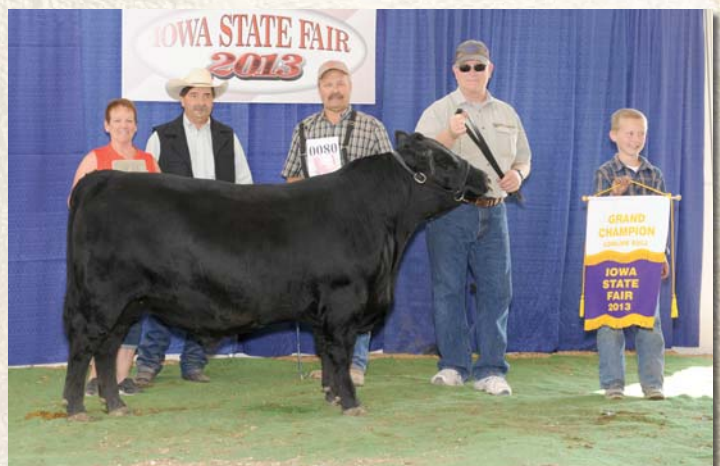
Spring Creek Zavier, sire of Lot 16

Bevy is a beautiful heifer that will grow into a big, full bodied cow. Her sire Zavier was Grand Champion bull at the 2013 Iowa State Fair and is an own son of the great Australian cow Zarzuela. Her dam by Full House is out of the super productive Admiral daughter Maimie.