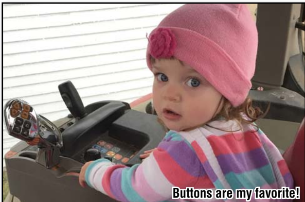
Buttons are my favorite!