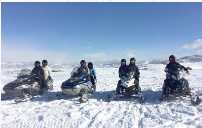
Birnie Family in Steamboat