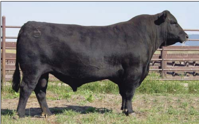
AAA Ten X 7008 SA

A moderate-framed, well-muscled, calving-ease bull we purchased in Canada. He brings outcross genetics and calving ease EPDs in the top 10% to our program.