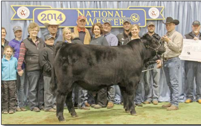
DLW Alumni 7513A ET