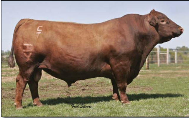
HXC Conquest 4405P