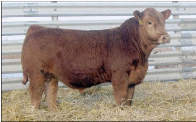
DDGR High Impact 40X

An AI sire that we have used successfully on heifers for several years that keeps the performance strong. He adds length and frame to his calves.