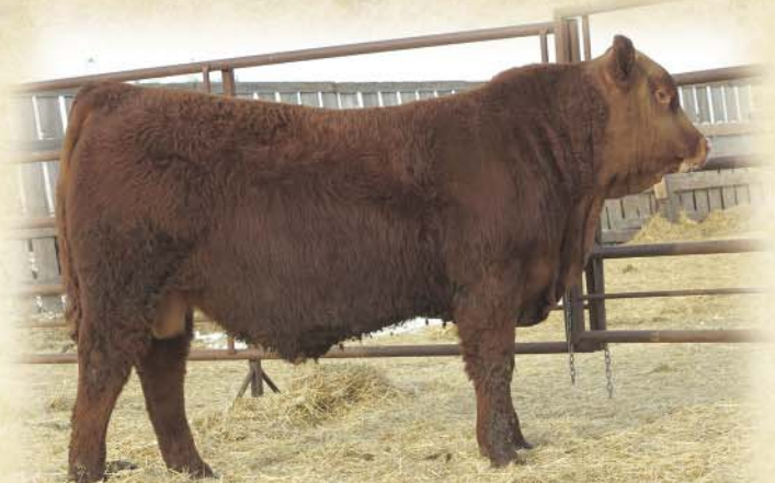
Lot 44 – DDGR FOUNDATION 107C