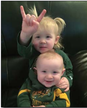
Go Bison! Five-time national champions!

Check out the depth of body on this calf; and his EPDs too. He has performance and calving ease EPDs above the breed average. And his young dam has a Total Maternal EPD that's in the top 4% of the breed.