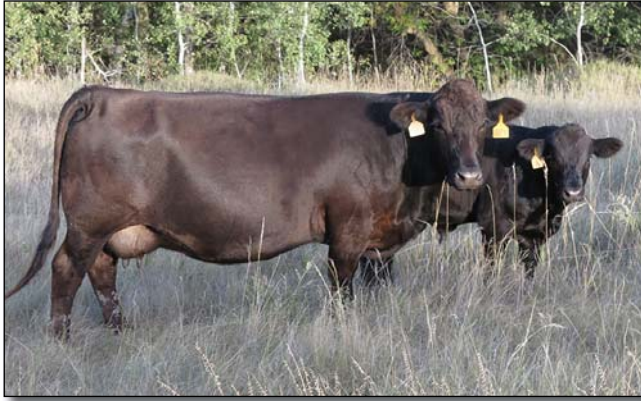
Lot 73 and his dam