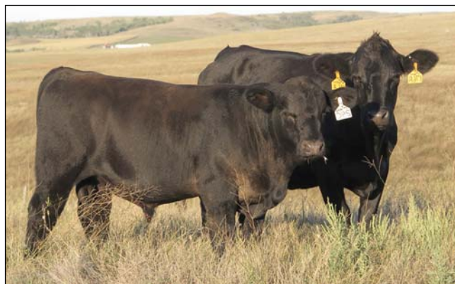
Lot 10 with his dam