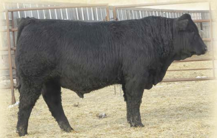
Lot 52 – DDGR INNOVATION 120C