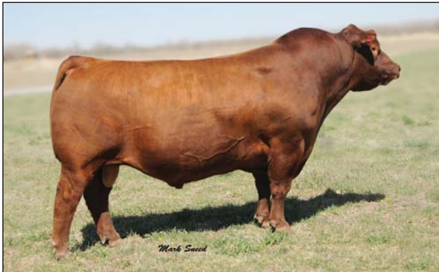
Fritz Justice 8013

A moderate-framed Red Angus AI sire we used to lower birthweights and add thickness to his calves. We are very happy with the performance and eye appeal this sire adds. With a -6.1 birthweight EPD and a 99 yearling EPD, he puts it all together.