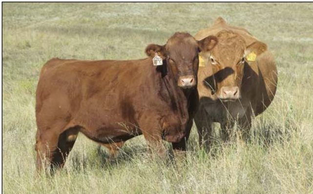
Lot 44 and his dam

An outstanding Balancer bull by the Fritz Justice sire. His weaning and yearling EPDs are no mistake as he had a weaning ratio of 114 and was the heaviest bull in the pen at the December weighing. His dam has a lifetime nursing ratio of 107 and granddam is a Dam of Distinction. LD panel pending.