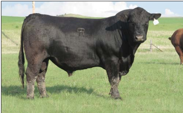
DCSF Post Rock Ten Plus ET

A Granite 200P2 son we raised here that we use on heifers. He has a calving ease EPD in the top 10% of the breed. He sires excellent thickness and length of body.