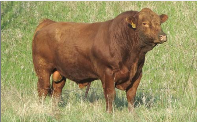
FRL Fir River Ted 489Y

A high performance sire we purchased from J & K Gelbvieh in Illinois. He adds power to his calves while adding length and frame.