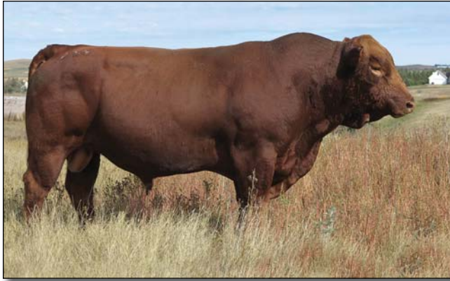
KKC Nobility 123Y