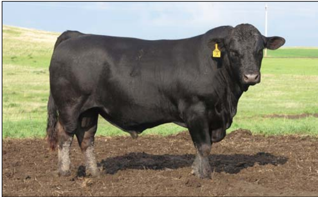
DDGR All In 1A

High-selling bull at Kalkota's 2012 sale. He sires dark red calves with excellent performance and his daughters are proving to be very productive cows. He sired the Nobleman bull that was the high seller in last year's sale.