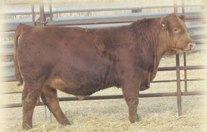
Lot 3 – DDGR CINCH 11C