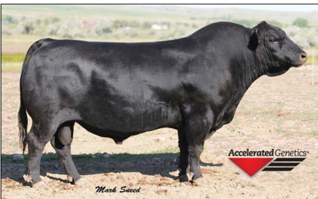
Sitz Dash 10277

A popular Angus sire that combines calving ease, performance and carcass very well. We used him mostly on heifers and were happy with the results. His calves have performed well since weaning and have great EPDs.