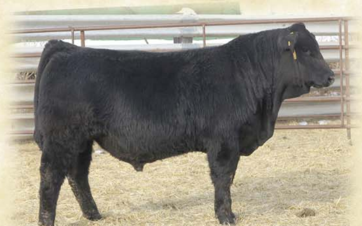
Lot 62 – DDGR KINGPIN 159C