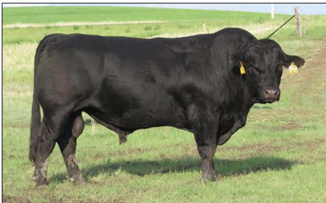
DCSF Post Rock Captain 153Z2

A 50% Balancer son of the famed Ten X Angus bull. We purchased him to use on heifers and were very pleased with his calves' combination of eye appeal, calving ease and performance.