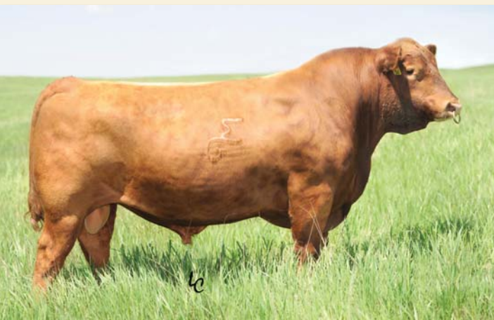
GMRA Peacemaker 1216