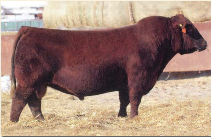
HXC Big Iron 0024X