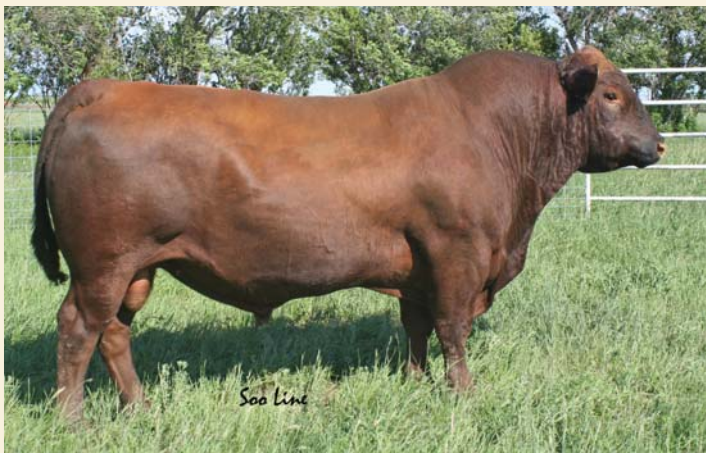
Red Corner Creek Cash 2R

Copper 127 is a bull we bought from Prairie Pride Red Angus to use on heifers. He has turned out better than even expected. The calves come nice and easy, and hit the ground running. They all look the same and are made with a very attractive look to them. Just wait till you see them and then you will understand. He passes on the same calving-ease and easy-keeping ability to his sons and they have good growth as well, yet maintaining a moderate frame.