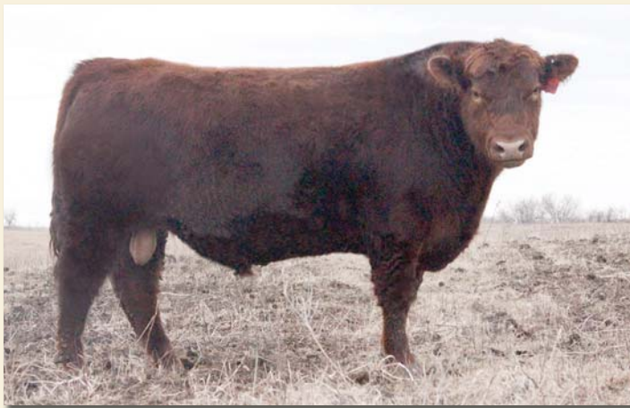
VVRA Indeed Z18

This is a great young bull that we raised and sold 1/2 interest in to Namken Red Angus. He is very thick and soggy with lots of eye appeal and out of one of my favorite cows. She has a perfect udder and always raises one of the best calves. The calves out of this young sire are proving to be outstanding. They are moderate framed, easy fleshing calves with exceptional phenotype.