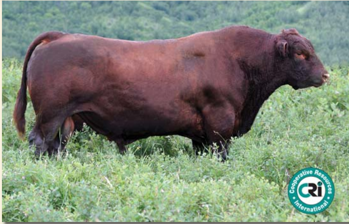
Red Crowfoot Moonshine 8081