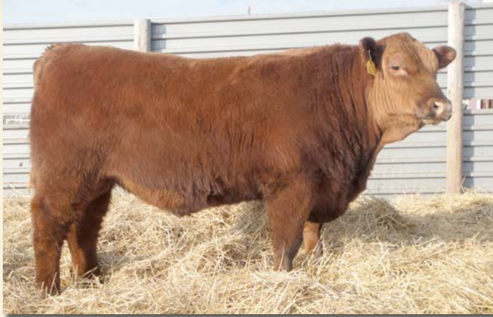
VVRA Classic Indeed X33