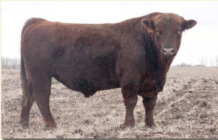
Prairie Pride Copper 127