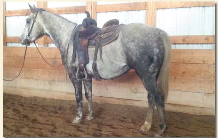
VR Dakota Fireman