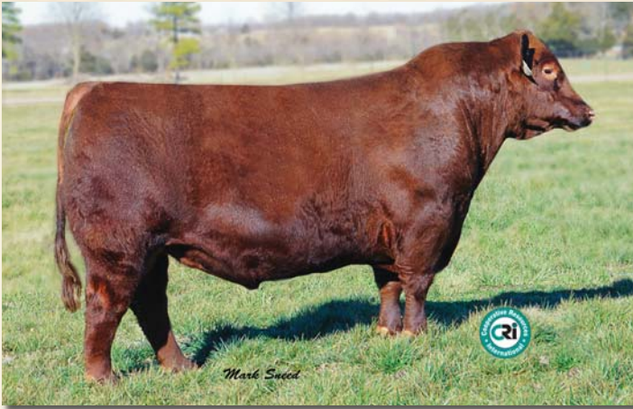
Brown JYJ Redemption Y1334