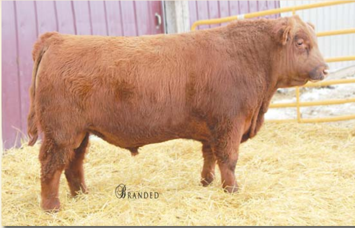
VRRR Epicurean A205