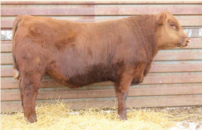
VVRA Bayberry Cash A28

This herd bull is one that we feel represents his sire Red Towaw Indeed as good as any son out there. He is extremely deep bodied and really thick and deep hindquarters, he is thick and wide all the way across his back and he has a good straight top line, with a nice head. He has excellent feet and is very correct. He is the result of a flush out of one of my favorite cow, P60 Eucla. On the first flush with only one straw of semen in her she had 27 eggs and 21 #1s and 3 #2s. We sold one bull brother to Crump Red Angus and we put four full brothers in our commercial herd and we put Z18 in the registered herd. He may not have the big, high EPD numbers but neither did Indeed himself and look what he did for the breed and how sought after he is. This herd bull (Z18) is very balanced, no super highs, no super lows, and he is phenotypically flawless. His sons are absolute studs! Come check them out.