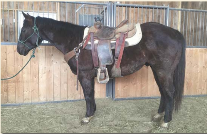
VR Dakota Bruiser

Crossbred calf that is 15/16 Red Angus out of a great cow. He will make great steers with a nice look.