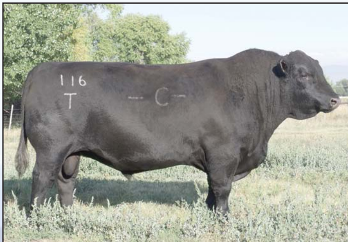
SVF Shamrock In Focus 116T "Rib Eye"

This heavy muscled, high volume bull has become the cornerstone sire of the Culver Cattle breeding program. Mountain Pass has been the most widely used bull in our A.I. program; we are attracted to his ability to consistently produce low birth weight calves that are vigorous and grow rapidly. Currently there are over 400 Mountain Pass daughters and granddaughters in the Culver Cattle herd. They are all deep bodied, easy fleshing, structurally sound females with perfect udders and ample milk to wean heavy calves. Mountain Pass is the sire of the 2009, 2010 and 2011 Grand Champion carloads of commercial heifer calves, and sire or maternal grandsire of the 2012 Grand Champion Commercial Heifer Carload at the National Western Stock Show. In addition to producing fantastic females, Mountain Pass also transmits feed efficiency and positive carcass traits. The 2007 steer calves sired by Mountain Pass graded 51% Prime 49% Choice with $170.73 paid in premiums. Semen available – $20.00 per straw (volume discounts available).