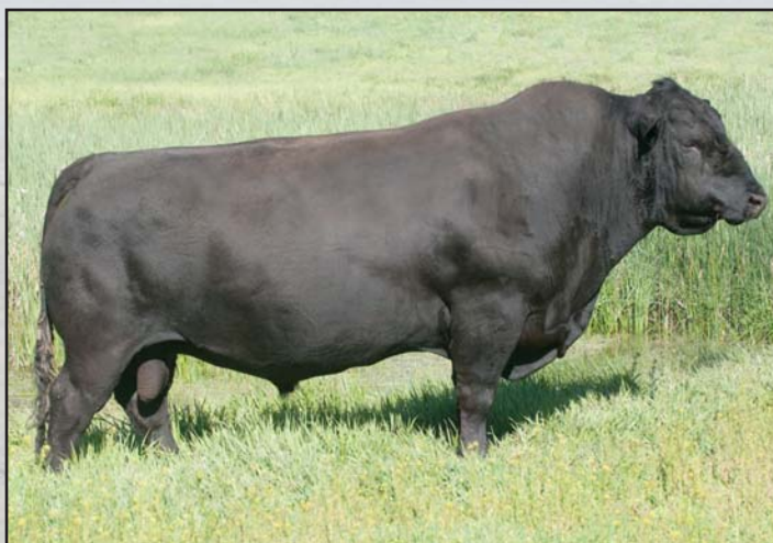
Redland Napoleon 2475

"Rib Eye" is producing offspring true to his pedigree – low birth weights and explosive growth. His sons are heavy muscled bulls with large scrotal measurements. His sire group topped our 2011 sale where 14 sons averaged $5,179. His first AI daughters are in production and are trouble-free, long-bodied cows with near-perfect udders that really milk. He was the co-sire of our 2011 and 2012 NWSS Grand Champion Commercial Heifer Carloads. Semen available – $15.00 per straw (volume discounts available).