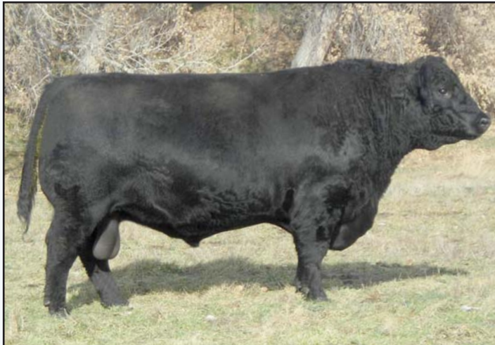
Sinclair Mountain Pass 4P138