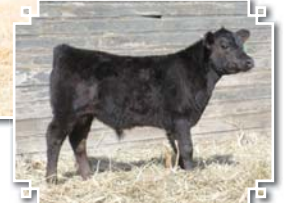
Boxcar Willie, son