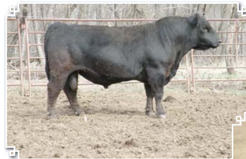
EZ Titan 7T