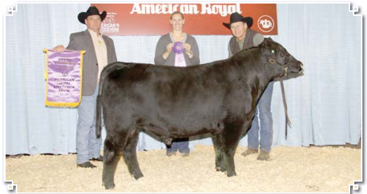
Bonanza's Prince 2Y

Prince is a long bodied, heavy topped, clean fronted, athletic son of the National Champion Muddy Creek Opinonated with excellent scrotal circumference and a superior ribeye measurement. He blew us away in Denver at 12 months of age when he weighed 695#, had a ribeye measurement of 13.05 for an astounding 1.88 ribeye area per hundred weight, having never eaten a bite of grain until a week before the show. He was the Grand Champion Bull this year at the American Royal.