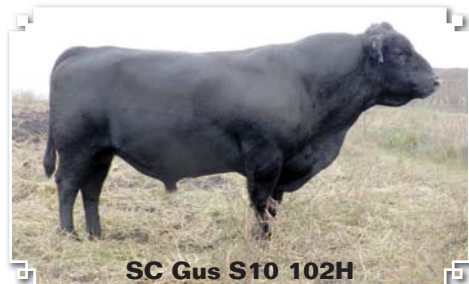
SC Gus S10 102H