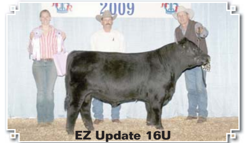
EZ Update 16U