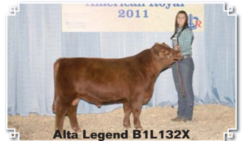
Alta Legend B1L132X