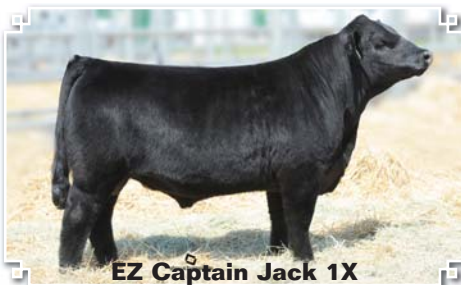
EZ Captain Jack 1X