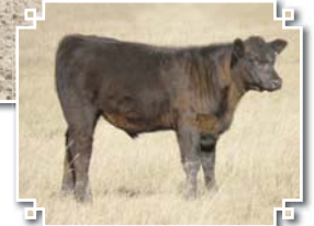
A Titan son

Titan is our proven son of Lisbon out of the Reserve National Champion Female, Lady Luck 51N. He was exceptional as a calf and his calves continue to have that same great look - they're really flashy. His calves are long sided, clean fronted and heavy topped, especially attractive calves when used on shorty blocky cows. He has awesome marbling and tenderness DNA numbers.