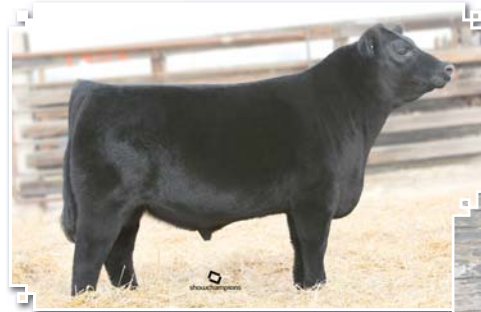
Bonanza's Boxcar 3Y