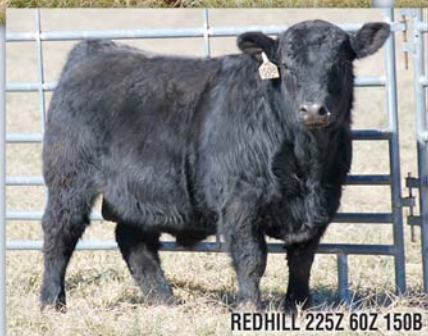
REDHILL 225Z 60Z 150B