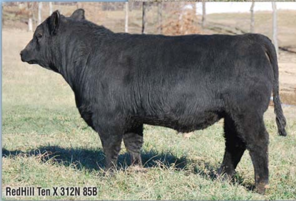
RedHill Ten X 312N 85B