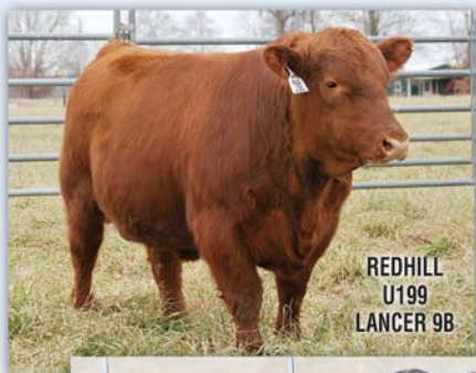
REDHILL U199 LANCER 9B