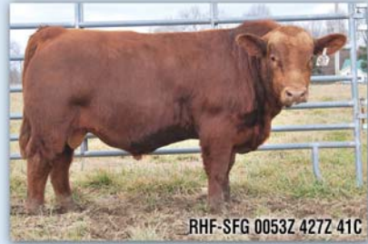
RHF-SFG 0053Z 427Z 41C