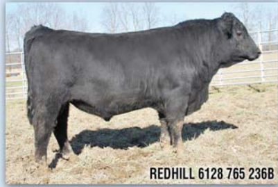
REDHILL 6128 765 236B