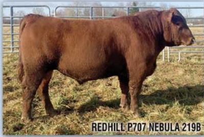
REDHILL P707 NEBULA 219B