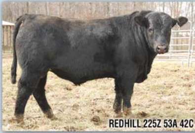
REDHILL 225Z 53A 42C