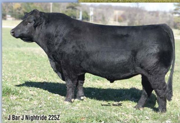
J Bar J Nightride 225Z