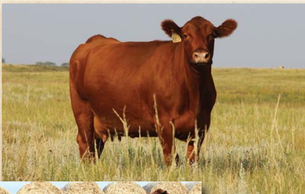
Koester Ms Yield 148, dam of 592