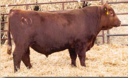
Schuler Confidence C810, service sire