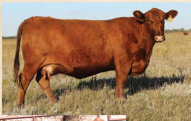
Koester Ms Merlot 312