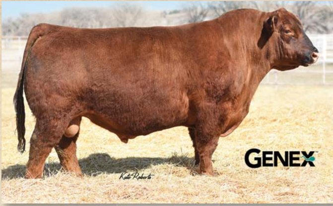
3SCC DOMAIN A163

Domain's extreme breed popularity is well deserved. After being used all over the country, his EPD proof has impressed us even more. He has extremely high maternal values with above-average growth and exceptional carcass values. His daughters in production are phenomenal. Domain is also improving feet and udder structure. He was the No. 1 Red Angus bull for sales at Genex last year. Owned by Sonstegard Red Angus, MN, Koester Red Angus, ND, & Genex.