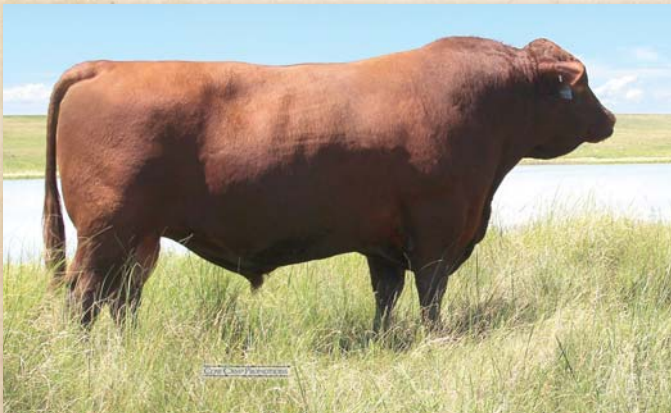
Reference Sire S, SCHULER CONFIDENCE C810

His sire, 5L Defender 560-30Z, has gained popularity because of his breed-leading marbling and REA ranks. Confidence's progeny have solid gainability, growth and carcass potential. Owned by Schuler Red Angus, NE, Croissant Red Angus, CO, and Koester Red Angus, ND.