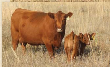
Koester Bond Girl 039, dam