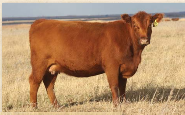
Koester Dominique 6106