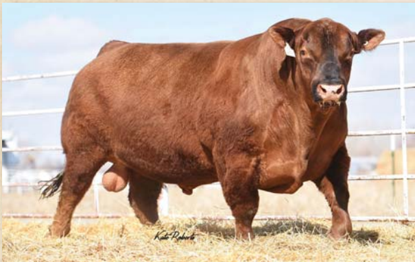
3SCC Domain A163, sire