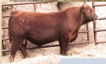
Koester Sonofadickens 741, son, sold for $6,000