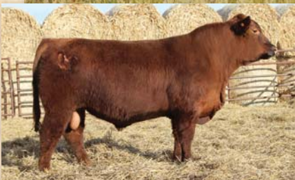
Koester Dimension 733, son, sold for $6,000