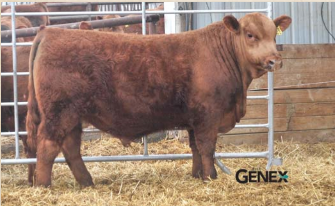
Reference Sire N, LELAND MARKSMAN 6629

Marksman sold in 2017 to Koester Red Angus and Genex, He is earning a reputation for excellent calving ease and maintaining solid HerdBuilder and GridMaster indexes. His Chateau 744 dam has a 79BW, 107WR on 4 head. Co-owned with Genex CRI, Leland Red Angus and Koester Red Angus.