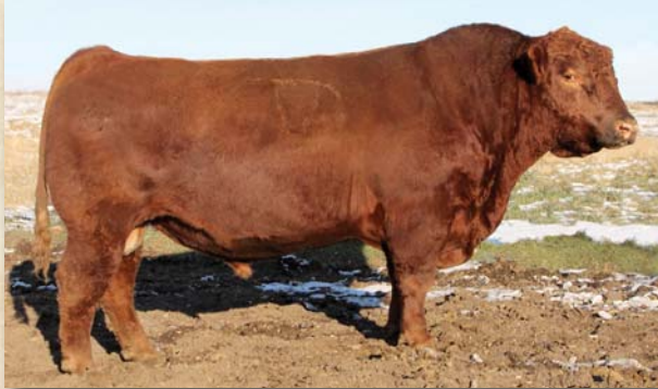
VGW Megatron 403P, sire