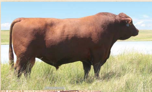
Koester Megatron 735, son, sold for $4,250