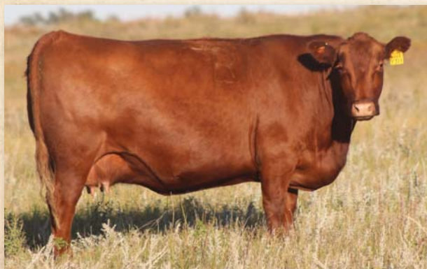
Leland Cool 9229-Y311, dam of 6144