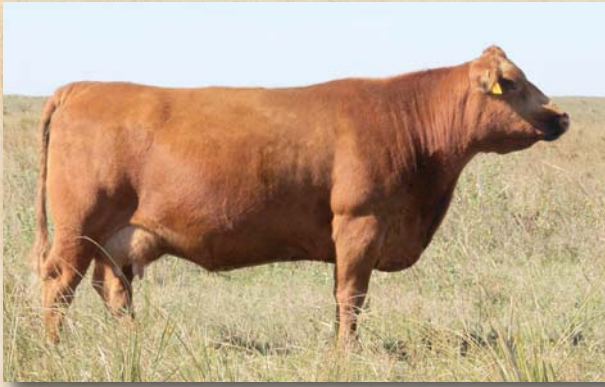
Leland Highlight 5370R, dam of 558