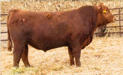
Koester Confidant 713, son, sold for $6,000