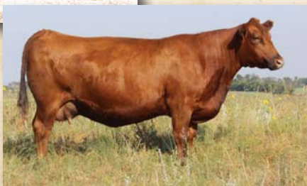
Koester Destiny 806, dam of 312

They were pregnancy ultrasounded on Feb. 17, 2019, and are on a full vaccination and health protocol. Most of them have been GGP-LD genetic tested and parent verified, and those that qualify as high-growth and high-carcass cows are designated with the Top Dollar Angus logo.