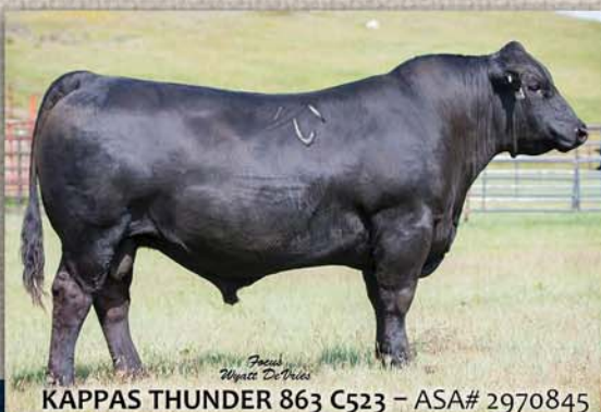
KAPPAS THUNDER 863 C523 - ASA# 2970845