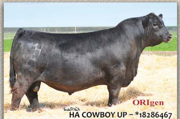
HA COWBOY UP - *18286467