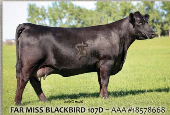
FAR MISS BLACKBIRD 107D - AAA #18578668