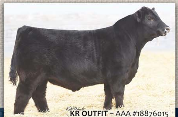
KR OUTFIT - AAA #18876015