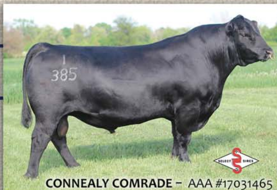
CONNEALY COMRADE - AAA #17031465