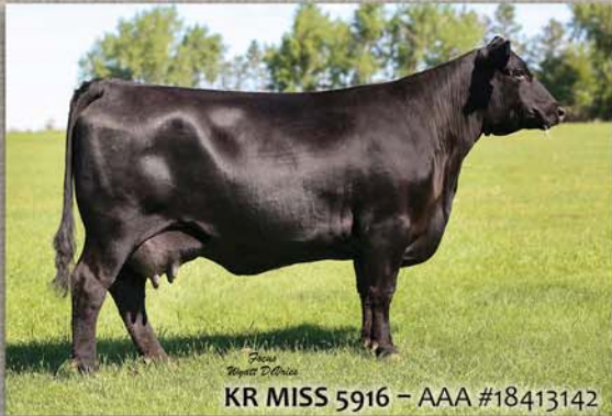
KR MISS 5916 - AAA #18413142

Directions to the ranch: Turn N. off Co. 12 (34th St NW) onto 120 Ave for 4.75 mi. until you come to the farm yard.