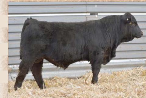
DCHD 096H AWB 4D COLD ONE x DCH HILLE W128 WESTBY