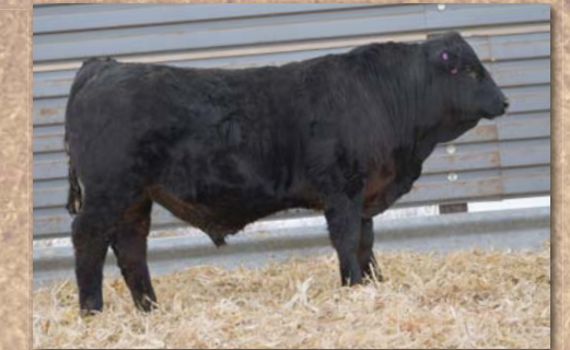
DDOC 287H DVE DAVIDSON MCGRAW 21B x HILLE W128 WESTBY