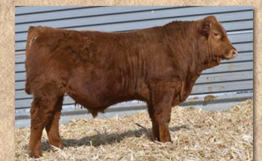
DCHD 301H DDGR 140F RENEGADE x DVE DAVIDSON MCGRAW 21B