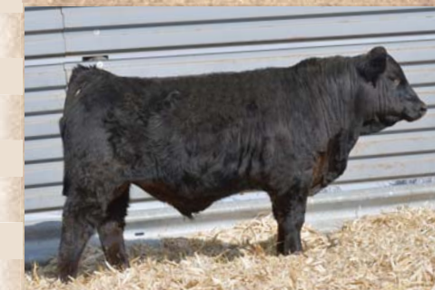
DCHD 217H AWB TWIN VIEW FOREMAN 43F x BDOC BAILEY'S GUY 205X