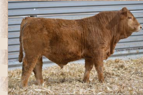
DCHD 070H DVE DAVIDSON MCGRAW 21B x DCH HILLE R126 ROY