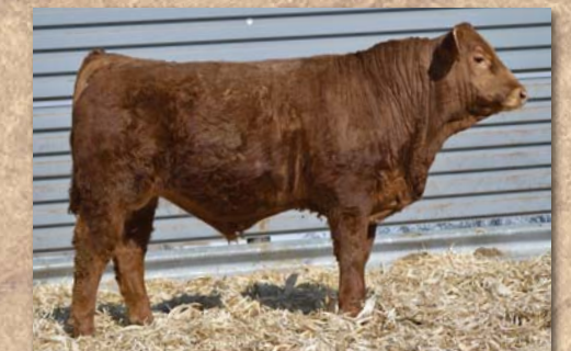
DDOC 278H AWB TWIN VIEW FOREMAN 43F x DCH HILLE T504 TREMOR ET