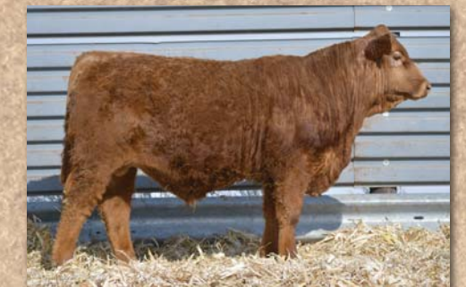
DCHD 153H DDGR 140F RENEGADE x CIRS 81NY